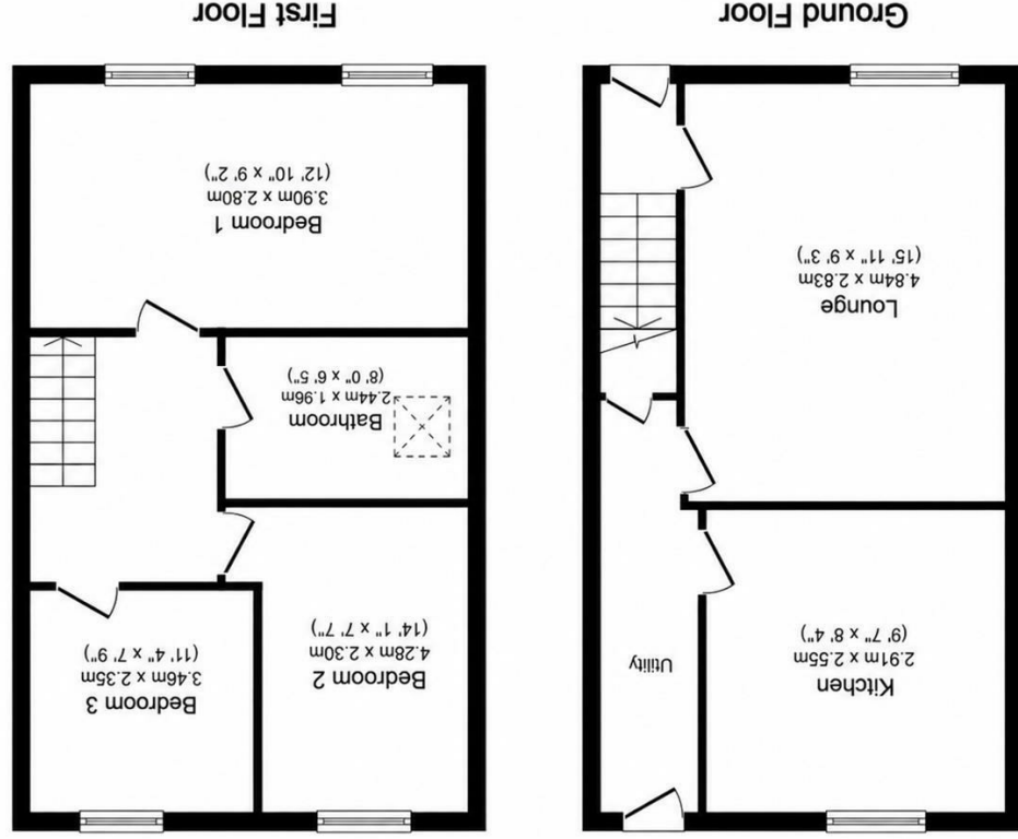
Total area 87.5 m 2 (942 sq.ft.) approx Floor plan for illustrative purposes only; not to scale.